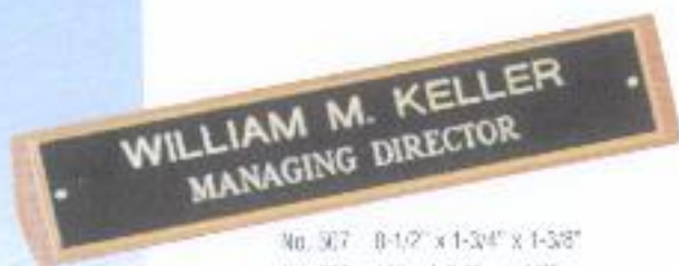
No. 307 8-1/2" x 1-3/4" x 1-3/8" No. 308 10" x 1-3/4" x 1-3/8"