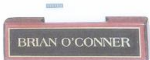
Rosewood Nameplate/ Cardholder No. 541