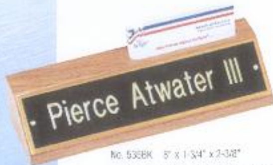
No. 535BK 8" x 1-3/4" x 2-3/8" Holds standard 3-1/2" long business cards