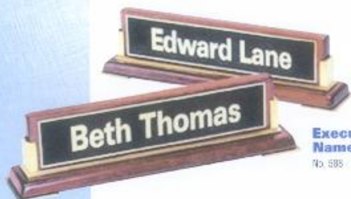
Executive Nameplate No. 585