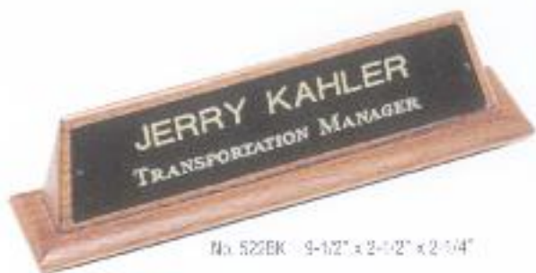
No. 522BK 9-1/2" x 2-1/2" x 2-1/4"