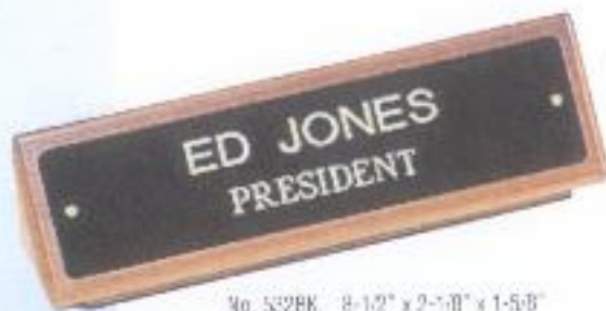
No. 532BK 8-1/2" x 2-1/8" x 1-5/8"