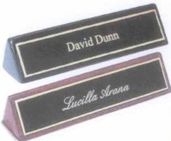
Black Piano-Finished Nameplate No. 556 9-1/2" x 2-1/2" x 2"